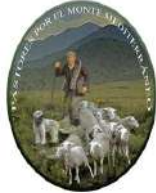
Asociación Pastores por el Monte Mediterráneo