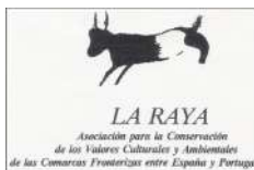
Asociación La Raya