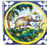
Plataforma en Defensa de los Ríos Tajo y Alberche de Talavera de La Reina