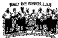
Red de Semillas: Resembrando e Intercambiando