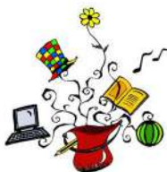
Asociación Cultural Caldero Mágico