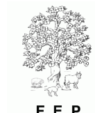
Federación Estatal de Pastores