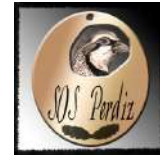
SOS Perdiz Roja